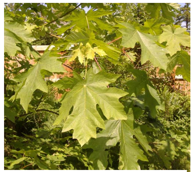
Acer macrophyllum, having the largest leaves of any acer.

Yes, it seems there are species snobs even in the Maple societies and the most far-out are the lovers of large-leaved species. These obses-