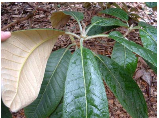
R. hodgsonii, a big leafed rhododendron

At this point in the narrative, the newsletter reported that gasps of astonishment rose from the audience for they were horrified to hear of