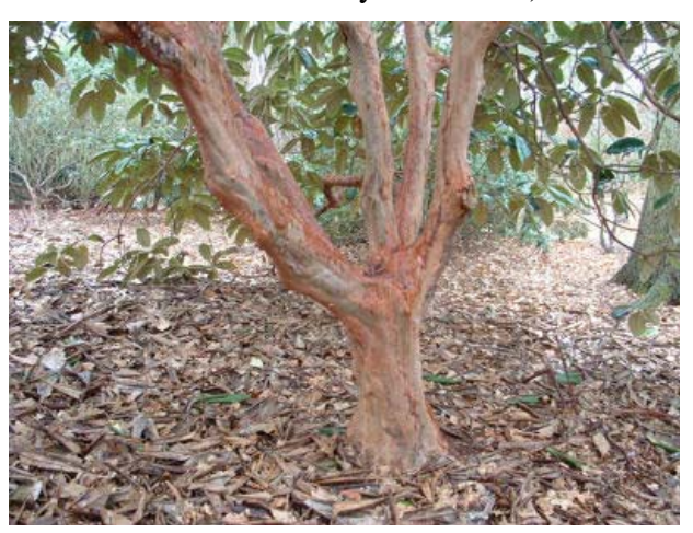
A small tree of R. hodgsonii